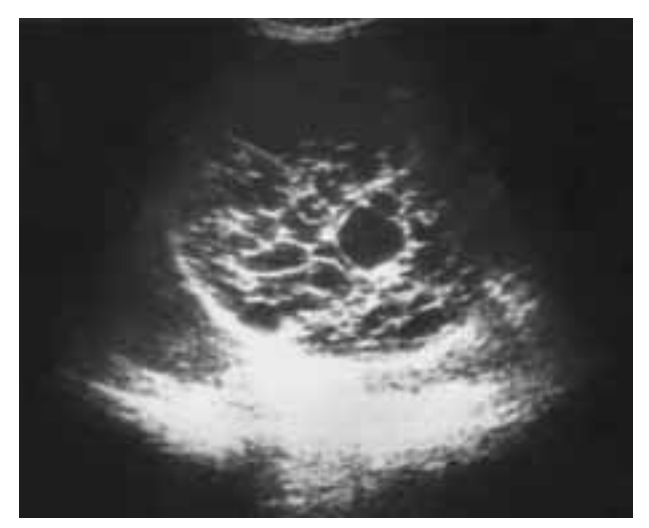
Figure 1. Ultrasonography of the abdomen shows a multiloculated cystic mass of the right kidney. The locules are noncommunicating with each other and thin septa separate them.

the tumor and the surrounding tissue. The cut section showed an encapsulated mass composed of multiple discrete cysts filled with clear fluid with variable dimension. There was no solid tissue (Figure 2). Pathologic examination of a specimen from kidney biopsy showed renal tissue with numerous cysts of variable size and shape lined by single flat or cuboidal epithelial cells. In some of the cysts, lining epithelium had a distinctive "hobnail" appearance. The cellular spindle cell stroma set between the cysts had a fibroblastic nature without smooth muscle, cartilage, or immature blastematous elements (Figures 3 and 4). There was no evidence of malignancy, and scattered inflammatory cells infiltration with tubular atrophy was shown in various sections.