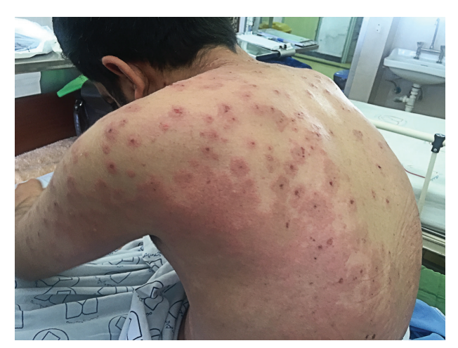
Figure 1. It shows a 33-year-old man with generalized pruritic skin papules, vesicles, targetoid lesions, urticarial plaques, and erosions

In our clinic, a skin biopsy was taken from the trunk lesions and histologic examination of the biopsy specimen revealed subepidermal blister, whose lumen contained eosinophil (Figure 2). There were numerous eosinophils in the upper dermis