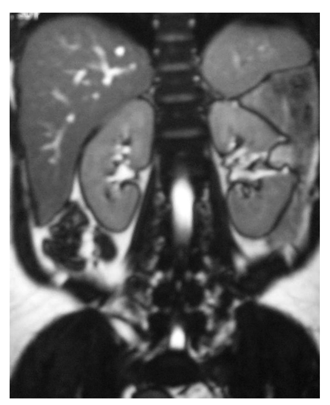
Figure 2. Coronal magnetic resonance image shows the exophytic lesion arising from the anterolateral cortex of the left kidney.

with that of mesenteric and subcutaneous fat. The lesion appeared to be very well defined, growing in an exophytic pattern from the anterolateral cortex of the kidney (Figures 2 to 4). Also seen were multiple enhancing vessels with a diameter of approximately 7 mm, traversing through the mass, which indicated that the mass was likely