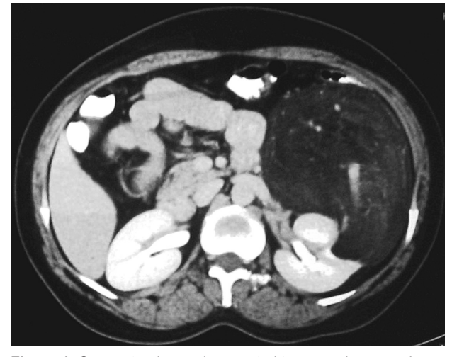
Figure 1. Contrast-enhanced computed tomography scan shows well-defined exophytic mass in the left kidney with an attenuation value of fat with a prominent vessel traversing the lesion.

The patient then underwent magnetic resonance imaging, and the mass was found to be hyperintense on both T1- and T2-weighted images with suppression on short tau inversion recovery sequences. The signal intensity of the lesion matched