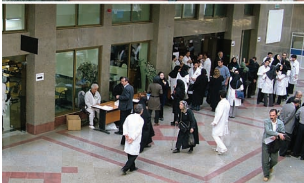
A screening program was held in Shaheed Labbafinejad Medical Center.

and the Urology and Nephrology Research Center of Shahid Beheshti University. High-risk individuals were invited by brochures distributed in the streets near the hospital to participate in the screening program. In March 13, more than 500 people with one of the following criteria presented to the clinic: age greater than 45 years, hypertension, diabetes mellitus, family history of CKD, and history of recurrent urinary tract infections. They passed a few