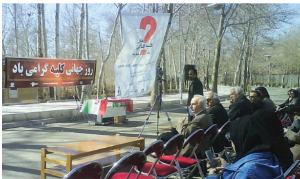
Tree Implantation day and the WKD were two occasions which were the reason to hold a special program.

will be referred to the nephrologists for further evaluations.