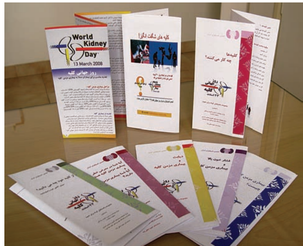
Educational pamphlets for the public were prepared by the Iranian Society of Nephrology and the Urology and Nephrology Research Center. They were distributed in many centers in which special programs for the WKD were held.

Eight educational pamphlets were published for promoting the public knowledge on kidney function, CKD, risk factor of CKD, hypertension and CKD, diabetes mellitus and CKD, nutrition of patients with CKD, etc. The contents were prepared and revised by a large group of experts and examined