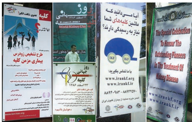
Posters and banners held in Tehran by several organizations.

to make sure that they were understandable and concise. In Shaheed Labbafinejad Medical Center, these pamphlets were distributed and a questionnaire was filled out by the participants to collect their feedback.